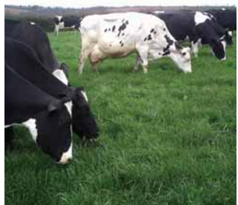
Dairy cows grazing one of our Matrix based mixtures. For more information see the panel on the left.